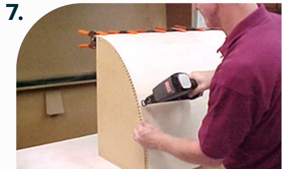
Staples can be used on the outside face along ribbing. Face is now ready for lamination.

Congratulations! Your project is complete, but this is just the beginning of opportunities with our Kerfkore products.