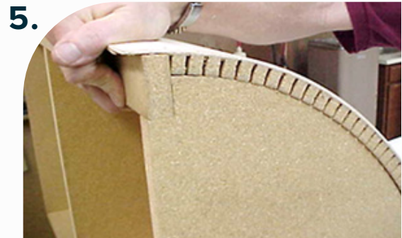
Press pre-sized and pre-cut panel to framework.