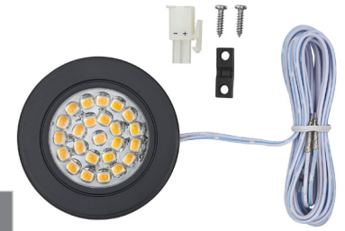
A- Nickel Finish B- Black Shown in photo