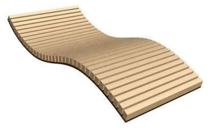
96" x 48" Barrel Bend