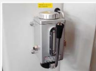
Oil lubrication unit