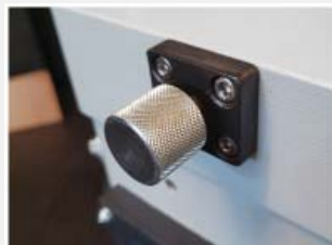
Manual locking to set blade at any angle