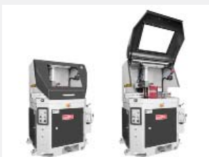
Liftable safety enclosure