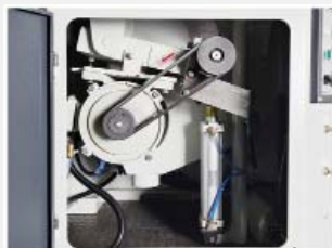
Powerful 7.5 HP motor & pneumatic cylinder