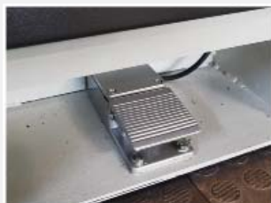
Standard foot pedal control