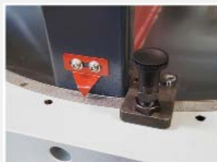
Quick indexing pin