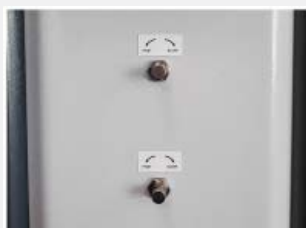
Adjustable clamping and cutting speed