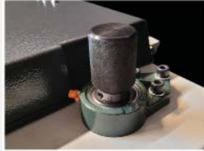
Micro thickness adjustment