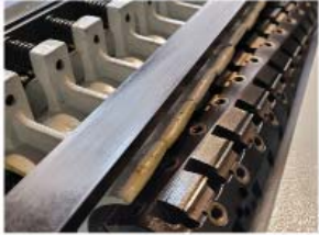
Spiral Insert cutterhead

The Cantek P508HV 20" Planer has a solid steel helical cutterhead with two-sided carbide knife inserts that require no adjustments when changing. With a digital readout and simple PC controller, setting the table height is quick, accurate, and easy. The frame is made from heavy cast iron with known vibration damping resulting in long bearing life and superior cut quality. The planer's segmented, serrated infeed roll & segmented pressure shoe ensures material is held firmly during the feeding and planing process. The P508HV planer has a quick-set micro-adjustable lever that easily raises and lowers the table rollers to aid in the feeding of difficult to feed wood. The industry standard 30x12x1.5mm carbide insert knives are positioned by two pins and held by a gib and screw which do not require any special tools to set the height. The knives have a slight bevel in the corners which provide for a superior finish without any stepping between the knives. In addition, the knives sit vertically into the head which produces a proper cutting angle and gully to allow for superior cutting depth.