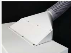
6" dust port