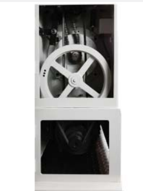
Feed mechanism and machine frame