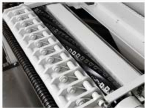
Spiral insert knife cutterhead