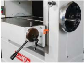
Quick adjust to table rolls

The Cantek P24HV 24" Planer has a cast iron table and head assembly with robust welded steel frame results in superior planing finish due to greatly reduced vibration. The spiral insert knife cutterhead runs extremely quiet and the solid carbide inserts provide a smooth finish and have a long life. When one edge gets dull simply rotate the knife 90 degrees for a new cutting edge. Knives can be rotated four times before needing to be replaced.