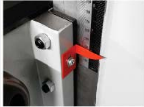
Table adjustment indicator