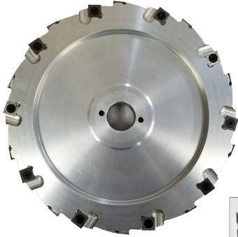
Includes 57mm insert cutter